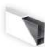
Metal "H" Channel